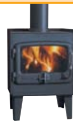
Nectre 15 (legs)