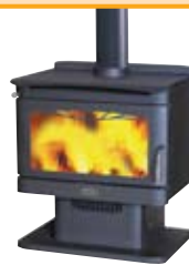
500 & 800 (pedestal)