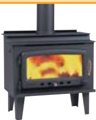
Nectre MkI (legs)