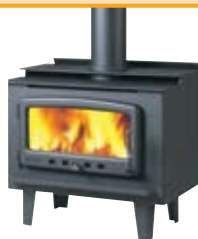
Nectre MkII (legs)