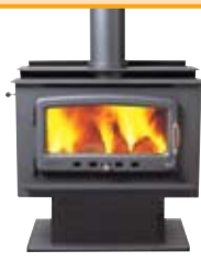
Nectre MkIII (pedestal)