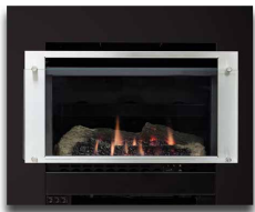
Stainless Steel on Black