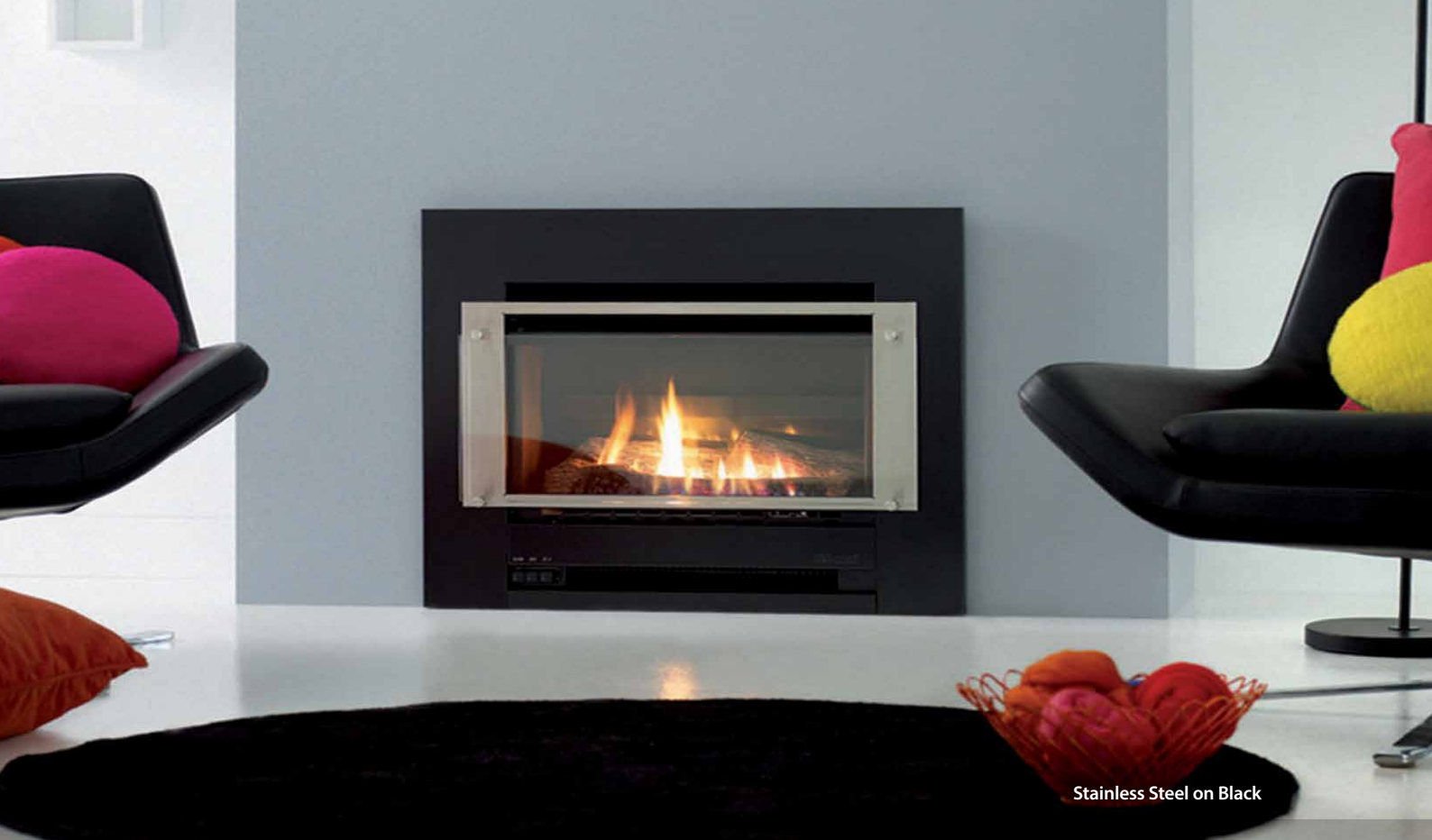
Stainless Steel on Black