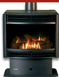
Freestanding in Black