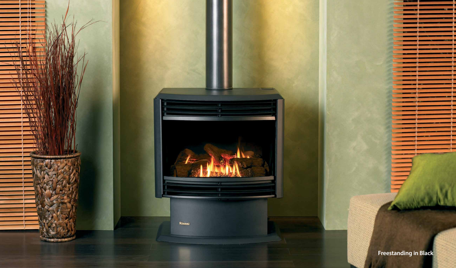
Freestanding in Black