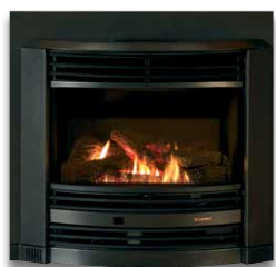
Inbuilt in Black