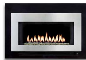
Stainless Steel on Black