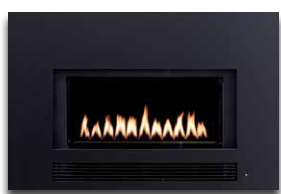
Flat Black Metal