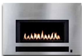
Flat Stainless Steel Metal