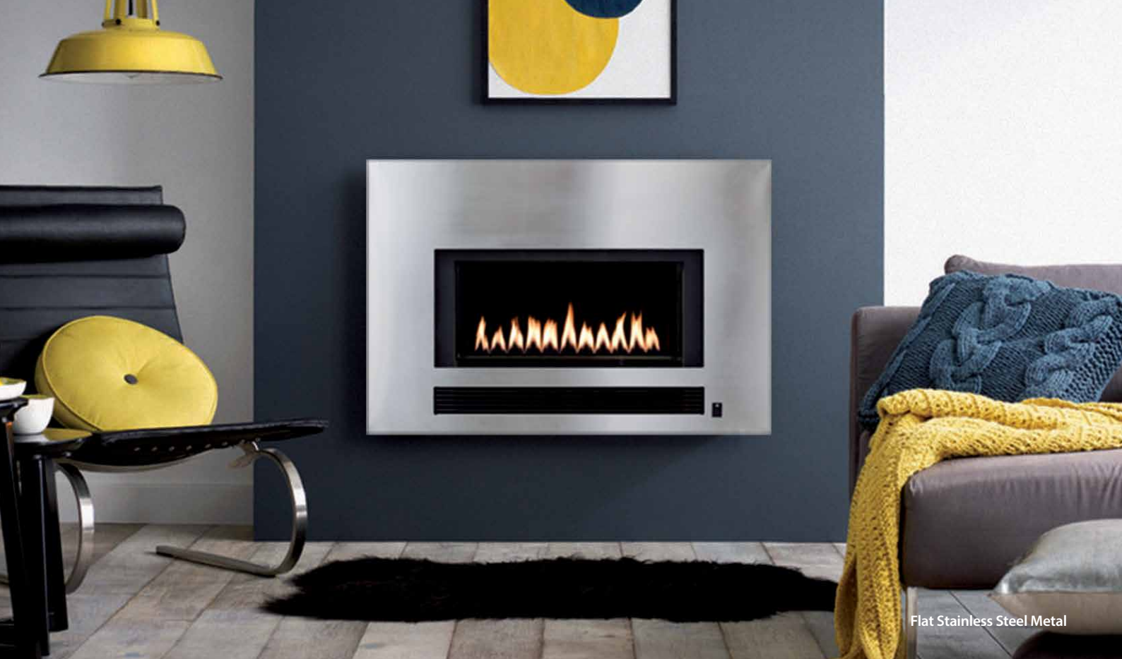
Flat Stainless Steel Metal