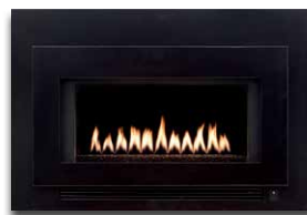
Black on Black